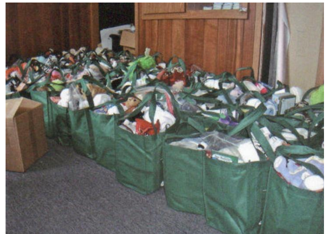
Food Bags Distributed by the BNOC for Christmas in July