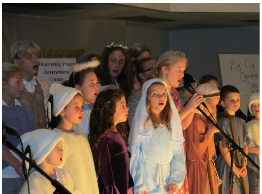
Cast of Just Believe, the 2011 Christmas Musical.

We are so excited that we have 12 youth signed up to go to the 2012 Youth Quake in Toledo on February 10, 11, and 12. The second deposit of $50.00 is due on January 15 th .